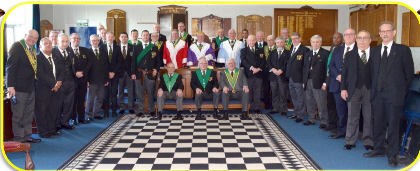
The Officers and Brethren of the Council with their guests, visitors and candidates