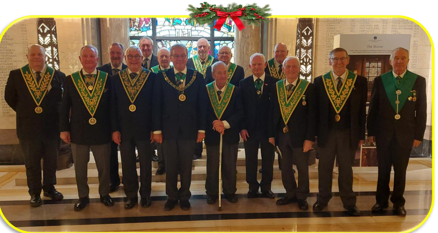
Some of the brethren from the District of Kent who attended Grand Council