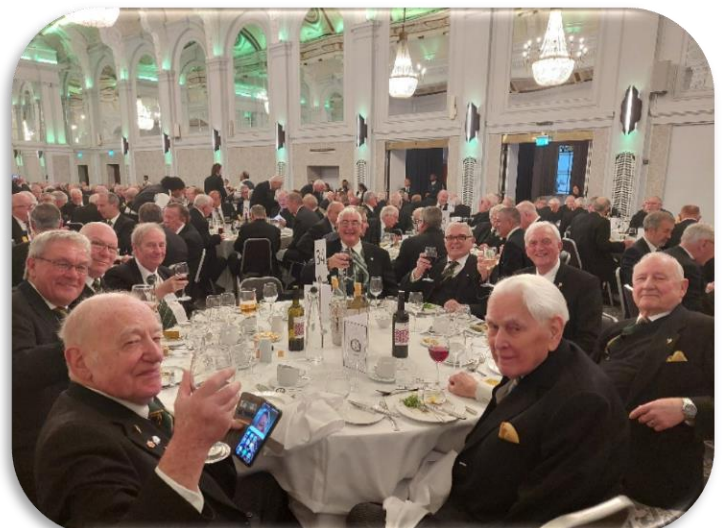
Finally, a wonderful lunch to celebrate a memorable day for those brethren from Kent who attended Grand Lodge