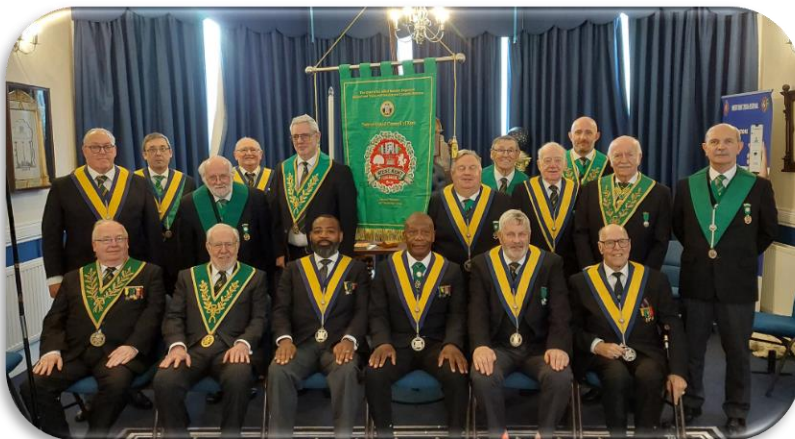
Members of the West Kent Council Proudly Displaying their new Banner