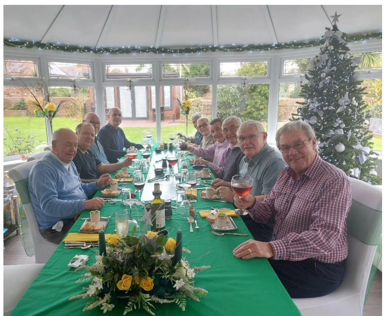
Members of the Exec and District Officers enjoying lunch