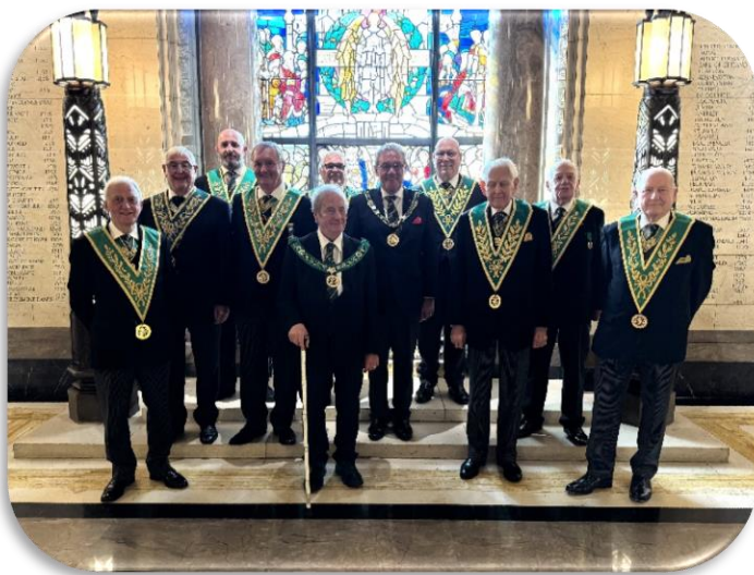
The Contingent from Kent all resplendent in their regalia supporting those brethren receiving preferment

First Appointment Promotion Promotion Reappointment