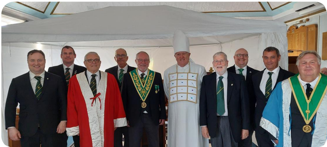
The principal officers for the Ceremony of the Grand High Priests with the candidates