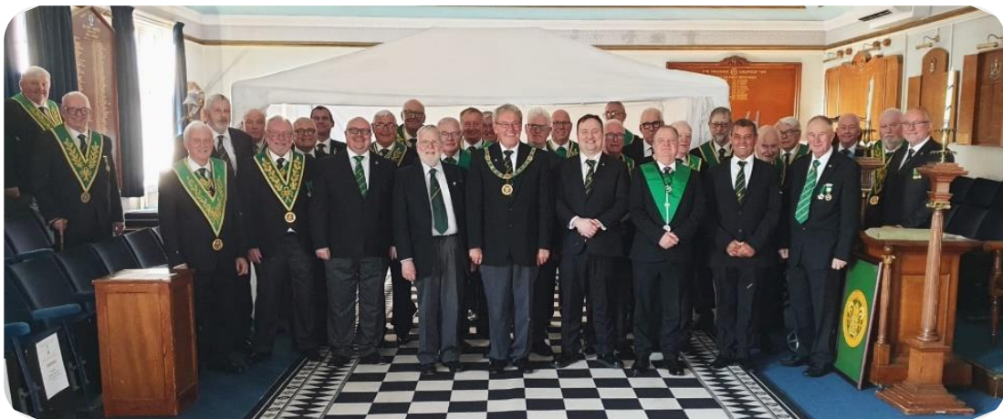
The brethren of the Roy Albert John Williams along with their guests and candidates